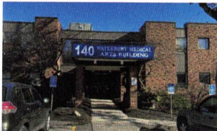
Waterbury 140 Grandview Avenue